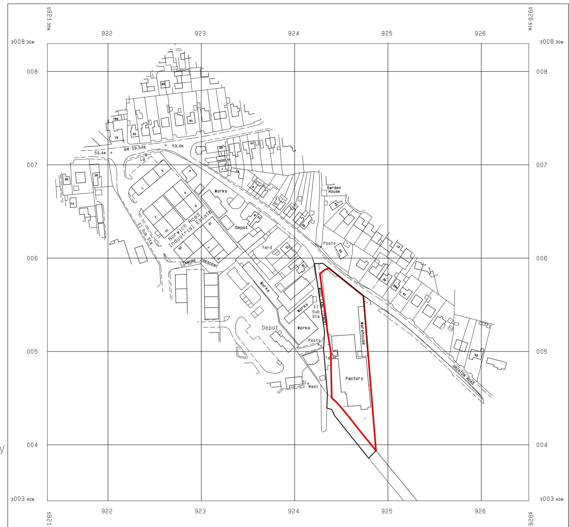
Ordnance Survey Location Plan Scale 1:2500

Ordnance Survey Superplan Data This product contains data surveyed at one or more of the following scales: 1/1250, 1/2500 & 1/10000. National Grid sheet reference at centre of this Superplan: TF 8200 The representation of a road, track or path is no evidence of a right of way. Heights are given in metres above Datum. The alignment of tunnels is approximate. Produced 06 Sept 2003 from Ordnance Survey digital data and incorporating surveyed revision available at this date. © Crown Copyright 2003 This Superplan product does not contain all recorded map information. © Crown Copyright. All rights reserved. Licence Number AL 100005917